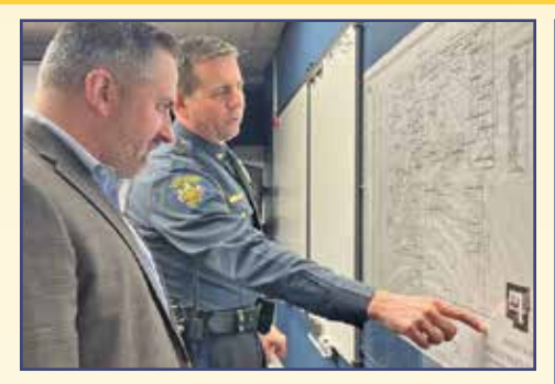
Touring Montgomery Township Police Department.