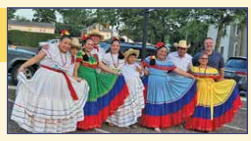
It's always a fun time at the Telford Night Market.