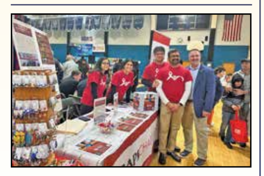
Celebrating the International Spring Festival at North Penn High School.