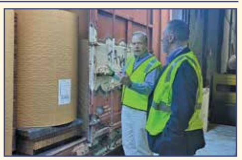
I toured Lansdale Warehouse Co. to learn about rail shipping in the district.