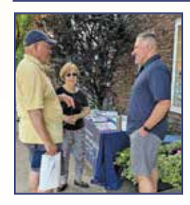
It's always a great time here at Souderton Third Fridays!