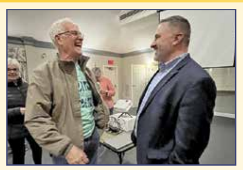
Meeting with residents of Hidden Springs Community.