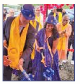
Thank you to Bharatiya Temple for inviting me to the groundbreaking for their new Learning Center.